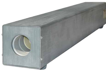
FT 801, side view